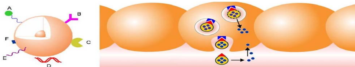
Figure 1. Different possibilities for nanoparticles specific targeting. In the left nanoparticle functionalized with: (A) protective polymer with targeting ligand/probe copulated; (B) Antibody; (C) Enzyme; (D) Complexation with DNA; (E) protective polymer; (F) ligand; In the right: nanoparticles can either release their content after cell internalization or near the cell after targeting a specific receptor.