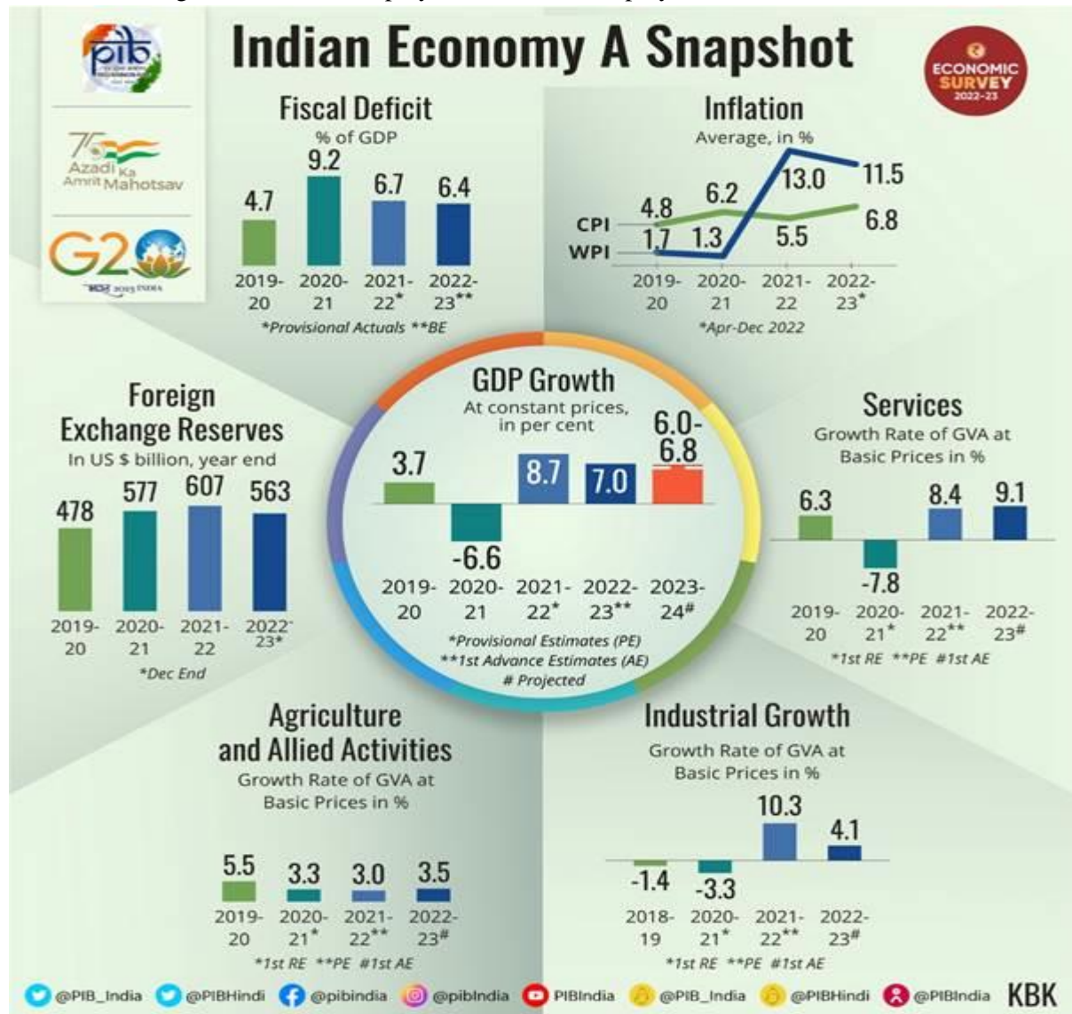
Figure: Summary of economic survey 2022-2023 (Source: https://pib.gov.in/PressReleasePage.aspx?PRID=1894932 )

and services, potentially contributing to increased output. However, the advantages of population growth to GDP are not guaranteed. Economic development as a result of population expansion is heavily reliant on the economy's capacity to absorb and effectively utilize the expanding labor force. If the economy does not supply enough job opportunities, the potential advantages of a bigger workforce are lost, resulting in increased unemployment and underemployment rates.